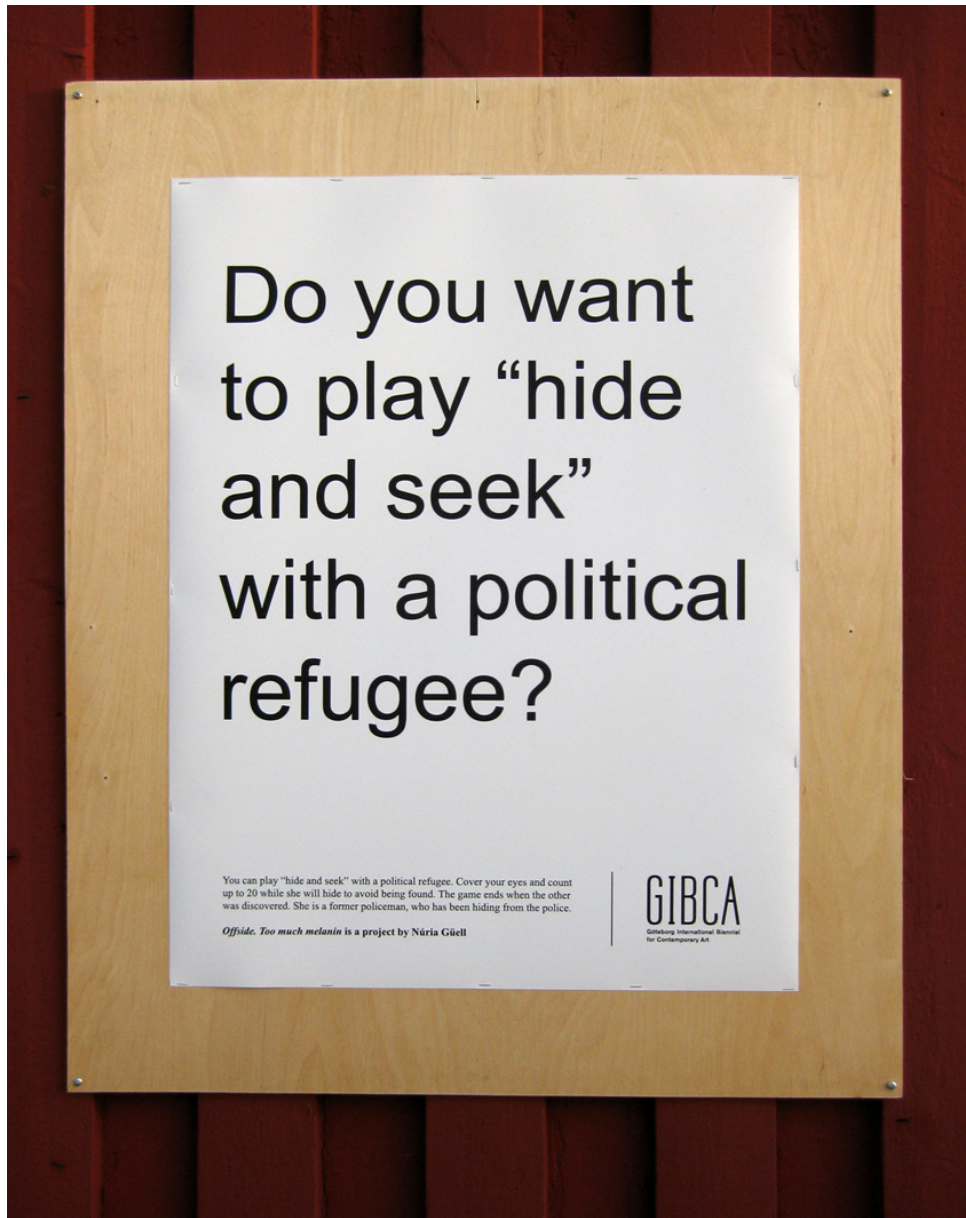
Núria Güell, Demasiada melanina (Too Much Melanin), Gothenburg Biennale, 2013