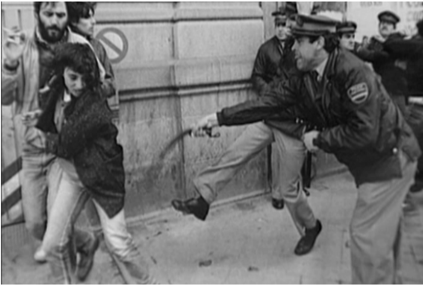
María Ruido, Plan Rosebud 2 (Rosebud Plan 2), HD video / 16 mm, 2008