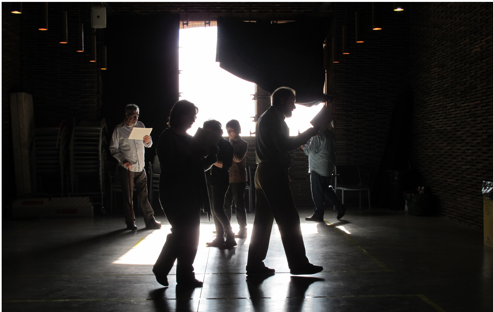
La máquina del tiempo (The Time Machine), Intermediae, Madrid, 2015. Collective art project with senior citizens that seeks to collectivise art production processes, directed by Javier Montero and produced by hablarenarte.