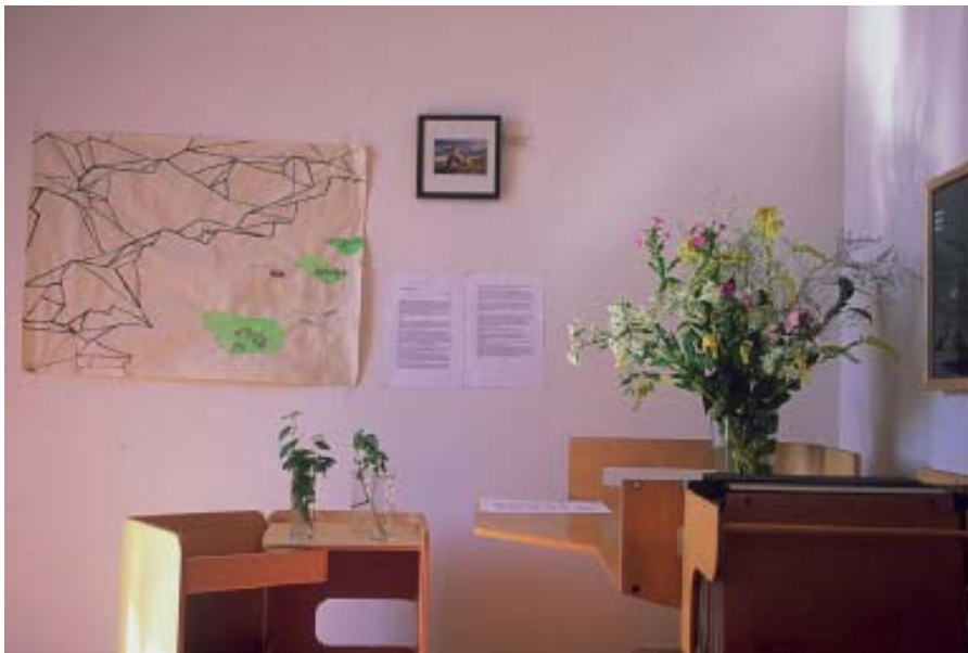
Photo of the lounge

Directora General y Curadora del Homenaje a John Cage – Proyecto Ciudad Medellín– 2012.