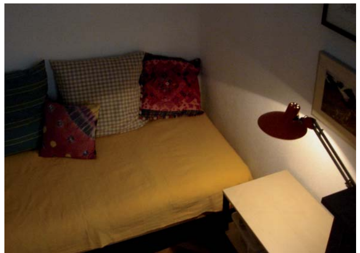
Photos of the lounge and the guest room