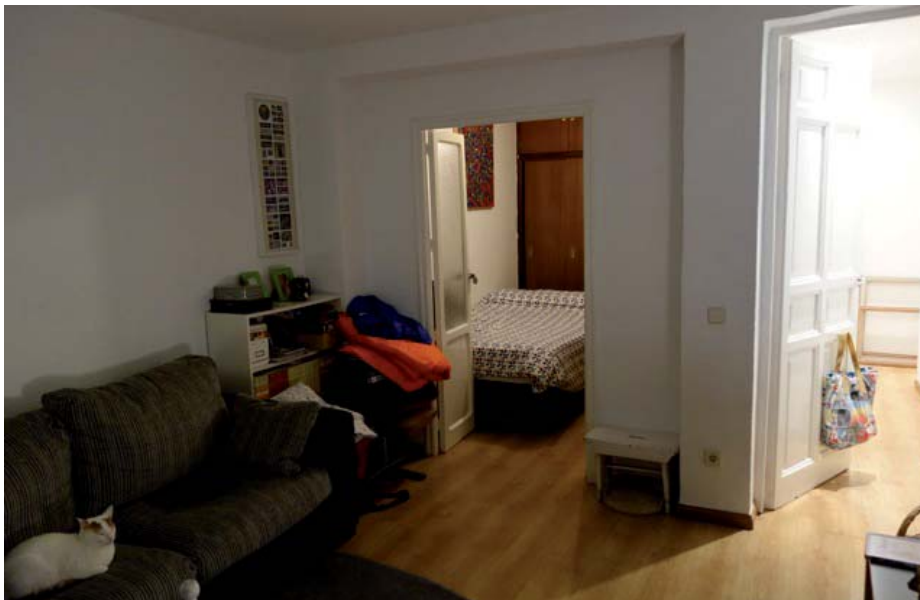
Photo of the guest room and lounge

http://www.fireislandartistresidency.org/