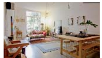
Photo of the guest room and lounge