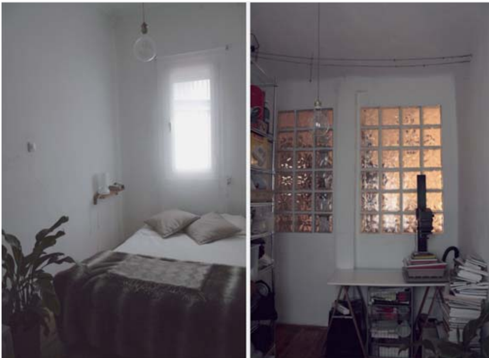
Guest room photos