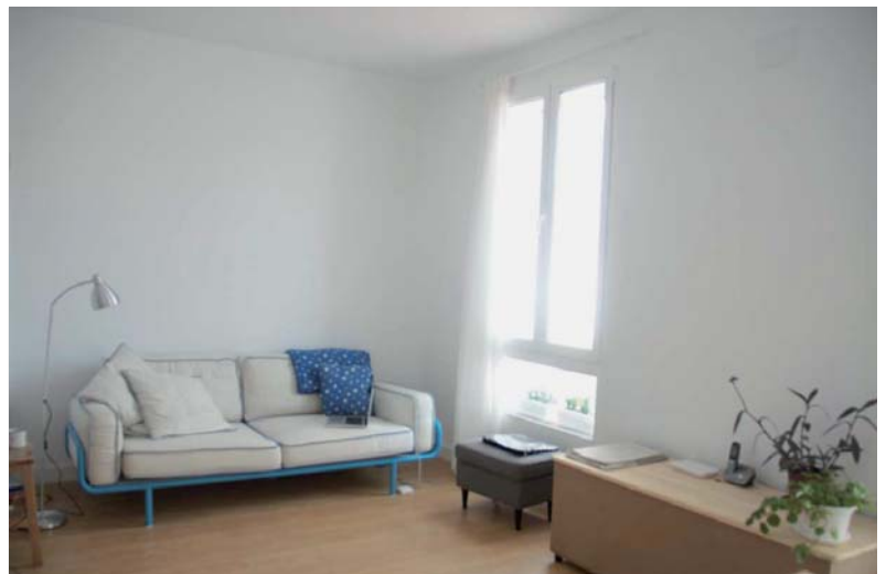
Photos of the guest room and lounge